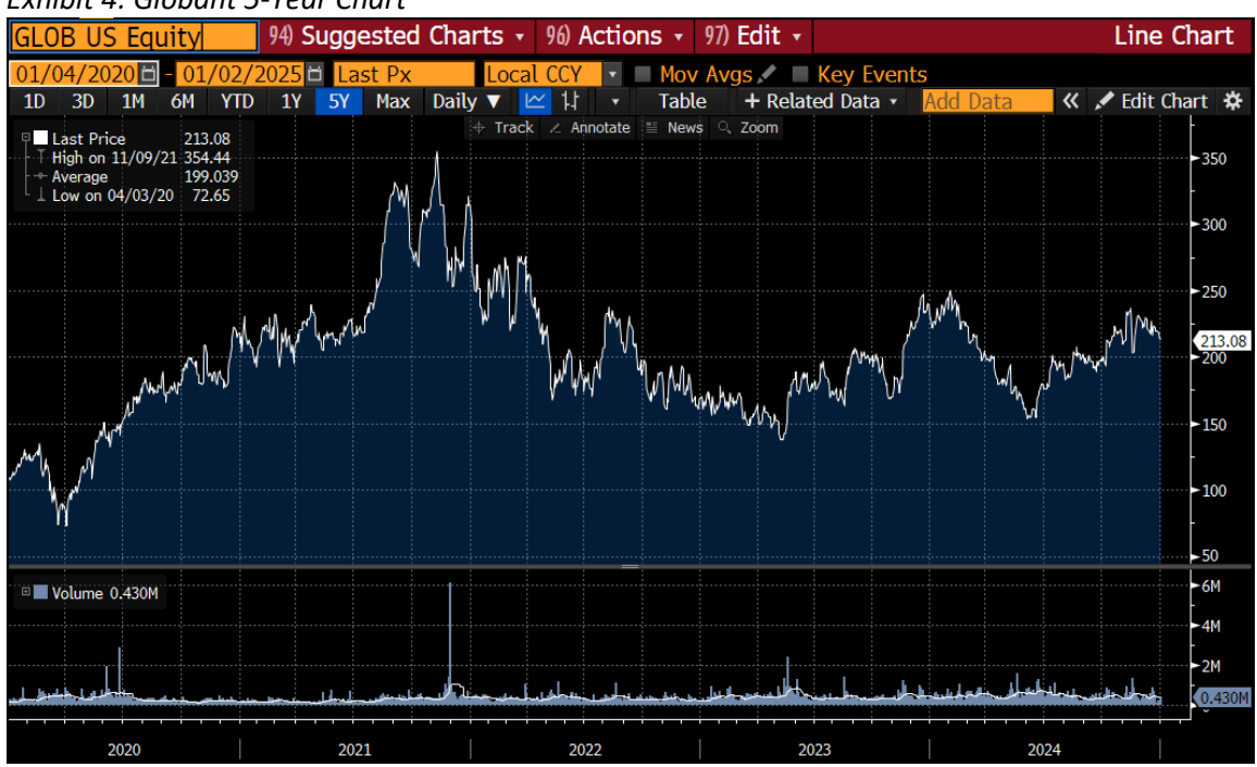
Exhibit 4: Globant 5-Year Chart

The investment thesis for Globant is supported by its position in the fast-growing IT services market, expected to expand at a 9% compound annual growth rate (CAGR) through 2027. Globant is capitalizing on the demand for AI-driven solutions, already generating over $100 million in AI-related revenue in 2023. Its diversified service offering across industries, combined with strong client relationships—evidenced by a high retention rate and a growing number of clients generating more than $1 million in annual revenue—gives it a competitive edge.