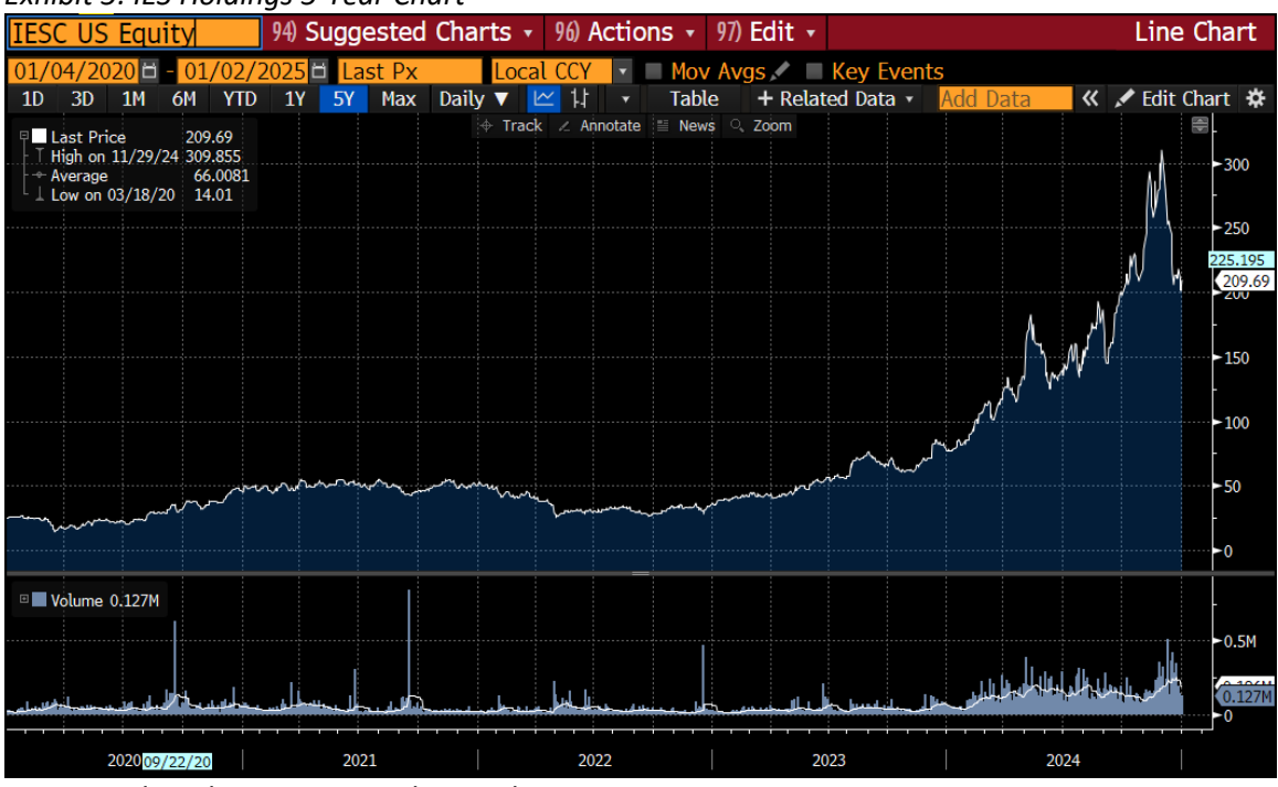
Exhibit 5: IES Holdings 5-Year Chart

IES Holdings (IESC) – IESC, led by Jeffrey Gendell's Tontine Partners, which owns more than 50% of the stock, exemplifies exceptional capital allocation. Gendell's successful acquisition strategy focuses on acquiring small companies at lower multiples, plus by growing the business organically by investing in projects with exceptionally high rates of returns, has been effectively applied at IESC over the past decade with low or zero leverage and no stock dilution.