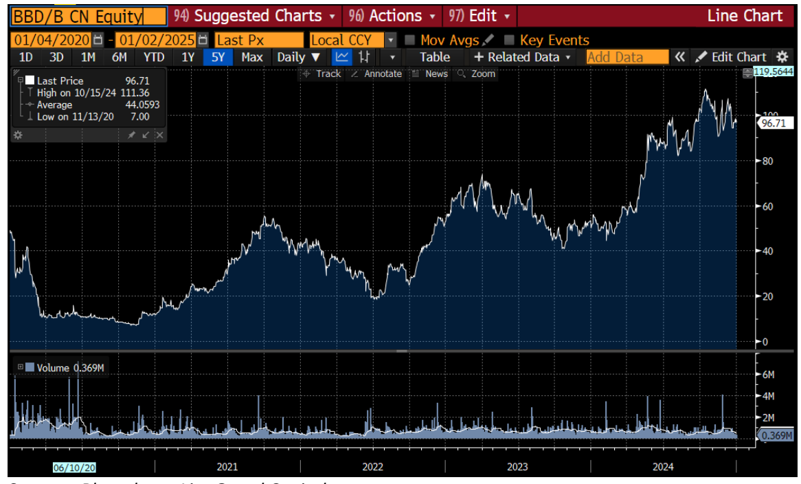
Exhibit 2: Bombardier 5-Year Chart

The company's solid book-to-bill ratio and the order for 244 aircraft from NetJets suggest a strong competitive position that will likely endure through the late 2020s. Most importantly, we do not foresee any capital-intensive projects in the near-term, which means that solid free cash flow generation will benefit shareholders. However, we are aware of likely forthcoming capital investments several years out, which must be properly reflected in DCF-based valuation. We encourage thoughtful investors to forego using EV/EBITDA valuation methodology, which does not incorporate future capital requirements. Overall, over the next 1-2 years Bombardier should be on track to achieve an increasing margin profile while reducing its leverage. This financial strength should enable significant capital returns to shareholders through share buybacks and dividends.